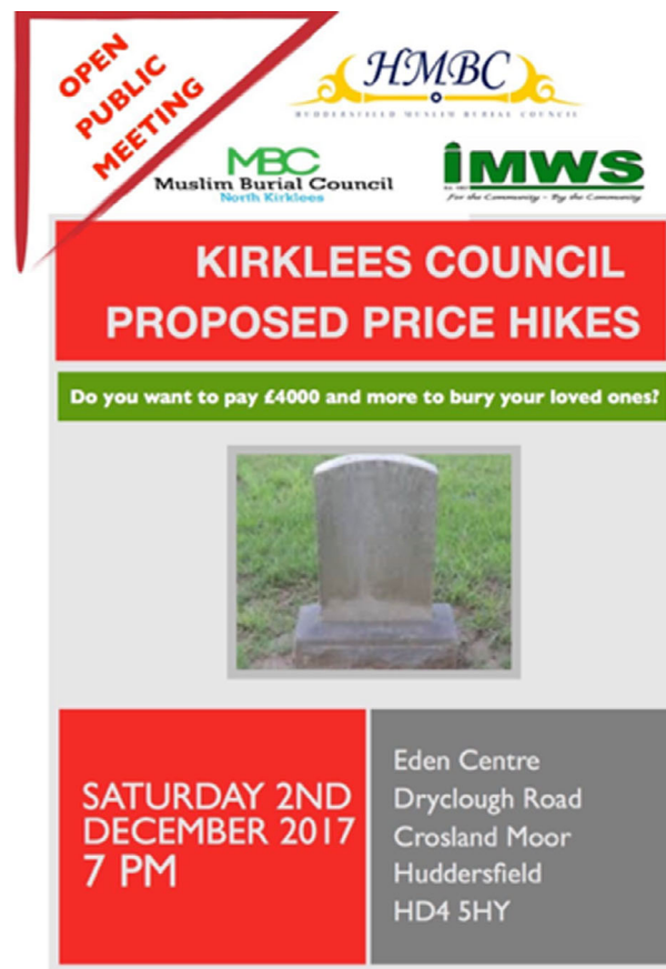
FIGURE 1 A flyer publicising a public meeting regarding increased burial costs in Huddersfield.

Shortcomings in service provision were also identified across the case study towns by minorities using crematoria. Participants reported varying ad hoc arrangements for Hindus and Sikhs to actively charge (or at least witness the charging) of