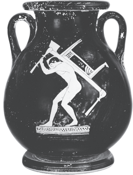
Figure 4. Pelike decorated with a youth carrying furniture, attributed to the Pan Painter, 480–470 BC. Oxford, Ashmolean Museum 1890.29 (BA 206330)