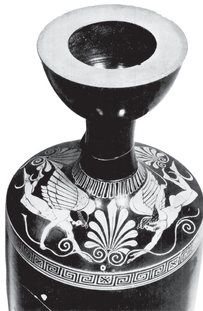
Figure 10. Black-bodied lekythos decorated with Erotes on the shoulder, attributed to the Pan Painter (no. 14). Adolphseck, Schloss Fasanerie 51 (BA 206362)