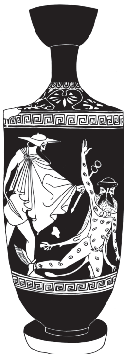
Figure 6. Lekythos decorated with Hermes slaying Argos, attributed to the Pan Painter (no. 3). Aphytis, 16th Ephorate, Aqv 505. Drawing by author