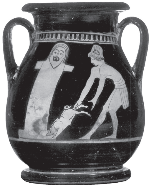
Figure 2. Pelike decorated with a boy sacrificing a piglet at a herm, attributed to the Pan Painter, 470–460 BC. Berlin Museums 1966.62 (BA 275276)