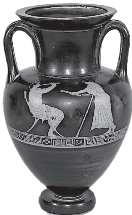
Figure 7. Nolan amphora decorated with draped youths, attributed to the Pan Painter. Brunswick, Maine, Bowdoin 1913.30 (BA 206318)

than any other shape, the proportion of Pan Painter lekythoi found at Gela is vastly out of proportion with his broader oeuvre . It is clear that he or more likely those for whom he painted these lekythoi (perhaps as a freelance artist) made a point of creating lekythoi for Gela, because they knew the Geloans or at least the Sicilians wanted them, seemingly primarily for graves.