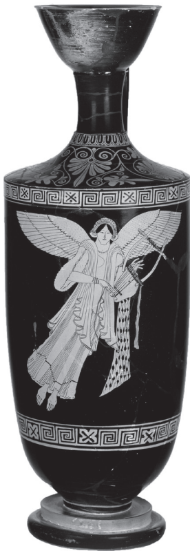
Figure 1. Lekythos decorated with a flying Nike carrying a lyre, attributed to the Pan Painter (no. 17). Oxford, Ashmolean Museum 1881.1401 (BA 206345)

Lekythoi come in many shapes and sizes (Fig. 5) and are ubiquitous in ancient Mediterranean graveyards, seemingly because the oil that they purportedly contained would have been useful for both funerary purposes and for the afterlife. The narrow body of this vessel does not provide a broad enough pictorial space for story telling