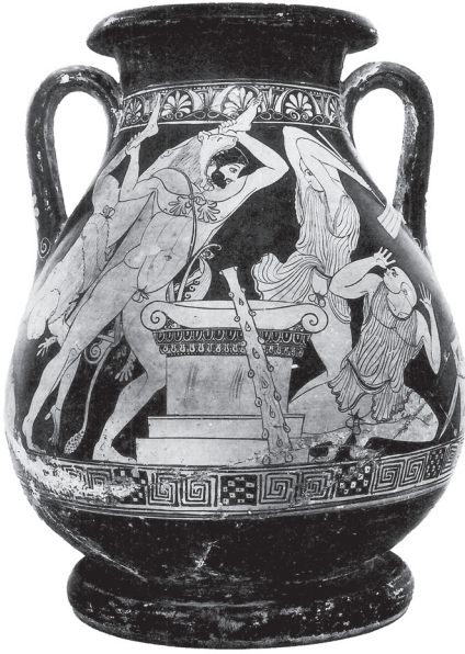
Figure 3. Pelike decorated with the death of Busiris, attributed to the Pan Painter, 470–460 BC. Athens, National Museum 9683 (BA 206325)