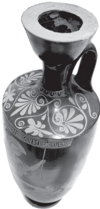
Figure 9. Detail of 5-palmette chain on the shoulder of a lekythos decorated with Theseus & Ariadne, attributed to the Pan Painter (no. 2). Taranto, MAN 4545 (BA 206410)