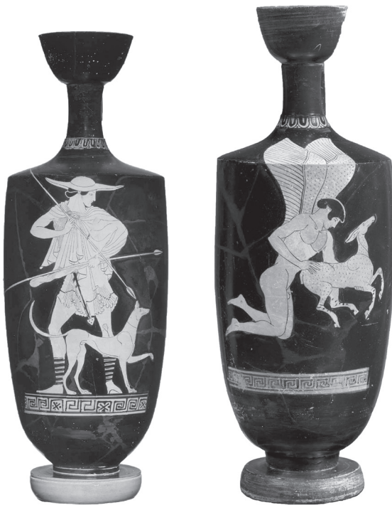
Figure 8. Two lekythoi , decorated with a hunter and dog and Eros with deer, attributed to the Pan Painter (nos 4 and 18). Boston, Museum of Fine Arts 13.198 (BA 206356) and 01.8079 (206357)