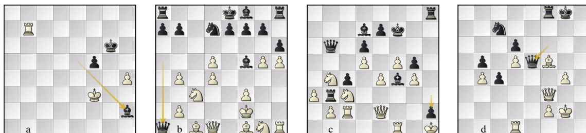
Fig. 2. (a) r1-g01 ST-W1 pos. 64w, (b) r2-g03 ST-IG p15w, (c) r2-g24 XI-Sv p50w, (d) SF-g06 AS-ST p47w.

The first semi-final went to extra time: no surprise. The evaluation graph for ALLIESTEIN's game 6 win, Fig. 4a, suggests that STOCKFISH never had a grip on the game, that maybe it lost its way around move 26 and that ALLIESTEIN was confident by move 34. By move 47, the victory via two connected passed pawns on the kingside was clear to both sides, see Fig. 2d: STOCKFISH saw it first.