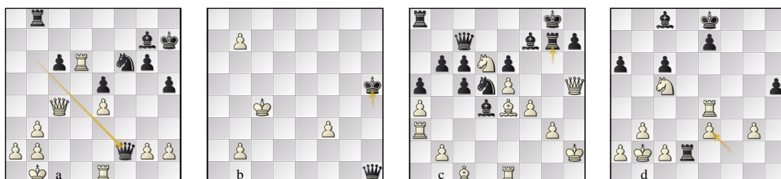
Fig. 3. (a) BF-g01 ST-Fi p28w, (b) BF-g02 Fi-ST p44w, (c) BF-g03 ST-Fi p28w, (d) F-g01 AS-LC p37b.