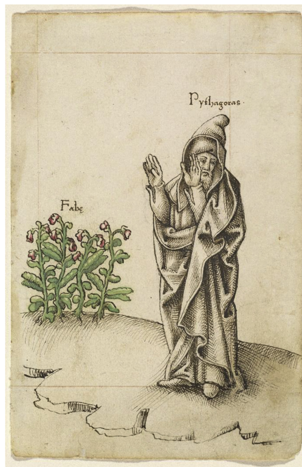
Fig. 2. An illustration showing Pythagoras avoiding faba bean plants. “Do Not Eat Beans” [fol. 25 recto], 1512/1514.