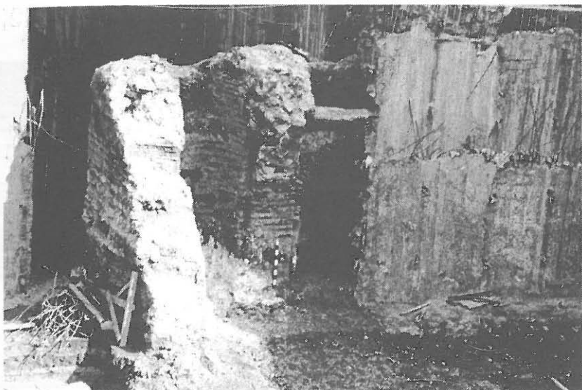
Fig.1 The prothesis and the main apse