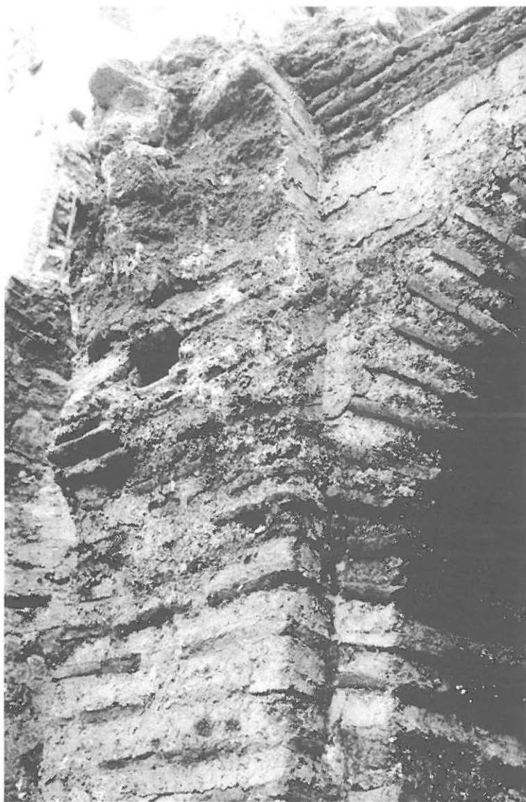
Fig. 5. North-East corner of the main apse, showing concealed brick technique