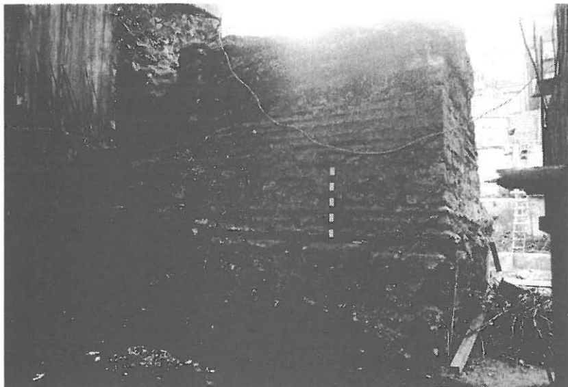
Fig.2 The main apse from the East