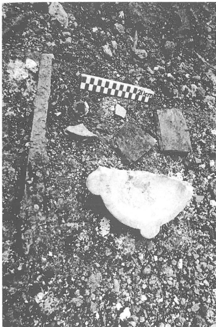
Fig. 4. Metal, marble, glass and ceramic sherds