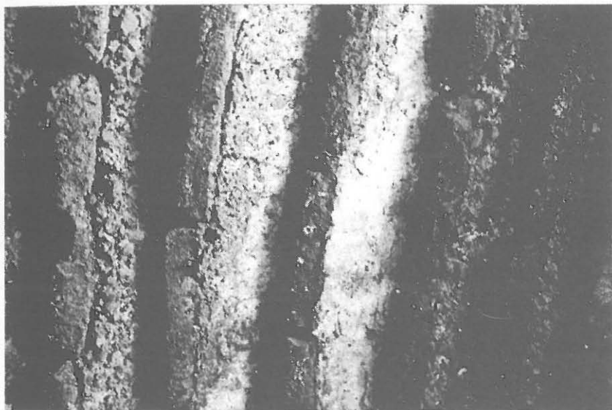
Fig. 6. Brick layers in the main apse