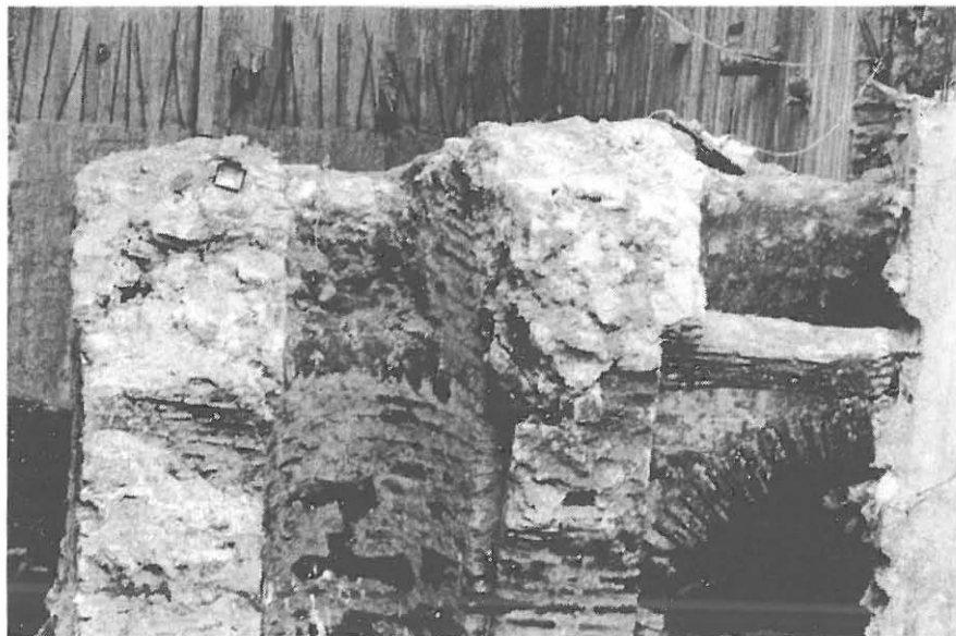
Fig.3. The main apse and prothesis from the West