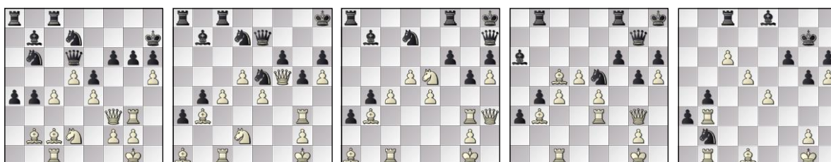
Fig. 3. LC0–HOUDINI, Game 8: positions (a) 27b, (b) 33w, (c) 35b, (d) 40w and (e) 54b.