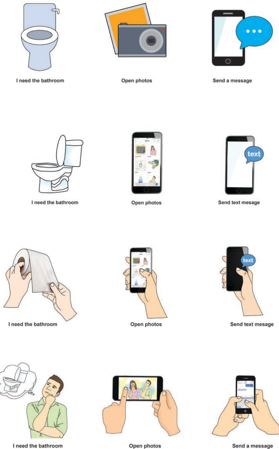
Figure 2: The changes in visual variation applied to the test materials: (a) object in icon style, (b) object in naturalistic style, (c) hand holding object, and (d) object shown in context.

The only exception was the presentation of “I love you” (Figure 3), which was kept consistent in icon style across the conditions given its more abstract meaning. As a frequent phrase that was likely to be used in the resources developed as part of the wider study, our team decided it was important to include this in the materials even though it was going to be controlled across all conditions.