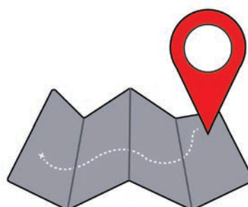
Look at map