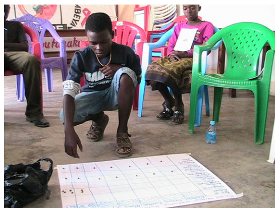
Figure 1 Young person completing participatory time-use exercise, Mbeya workshop

In the research on sibling caregiving in Tanzania and Uganda, my role in bringing different stakeholders together for participatory dissemination workshops reflected that of a 'mediator and conciliator' in Benequista and Wheeler's (2012) typology of the communicative roles of researchers. I considered that visual representations of young people's experiences and priorities could help to reinforce findings for policy and practice audiences. Quantitative data about young people's caring activities gathered through a time-use diagram could be quickly collated, presented and discussed with NGO staff and community leaders in the workshop the following day (see Figures 1 and 2). The quantitative evidence about the mean number of hours of care work that young people engaged in per week, disaggregated according to gender and position within the household, gave greater weight to my findings and helped to emphasise the significance of their care work for