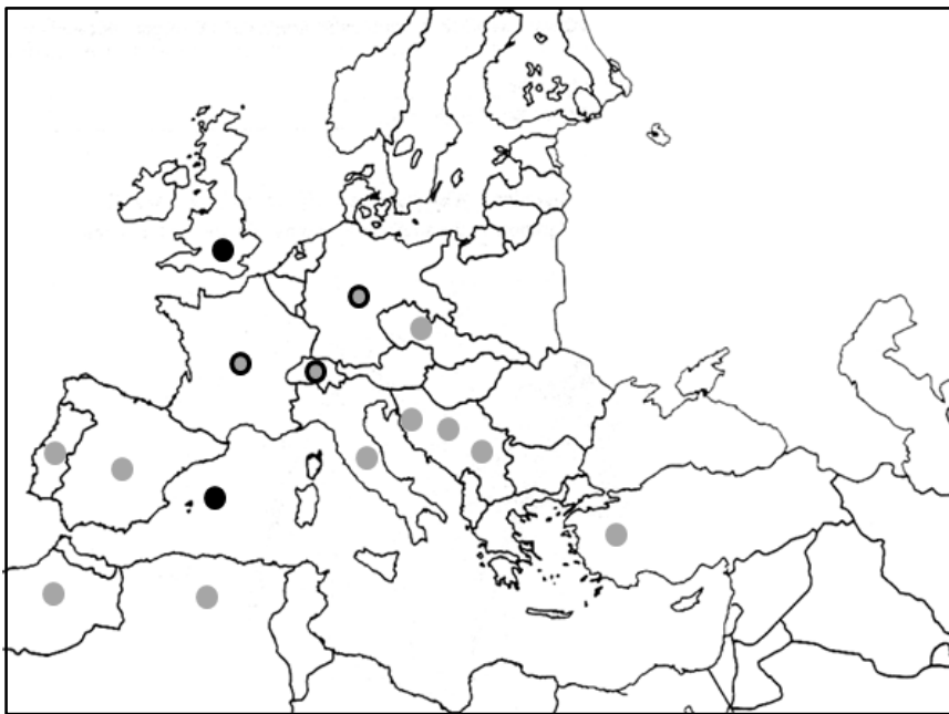
Fig. 2 Current known distribution of Anthrenus angustefasciatus . ● = data from Kadej et al. (2007), ● = data published since Kadej et al. (2007), ● = additions from the current study.

The National Dermestidae Recording Scheme is run through Biological Sciences at the University of Reading. Records should be submitted via iRecord with attached images for verification but GJH would be very happy to assist with identification of