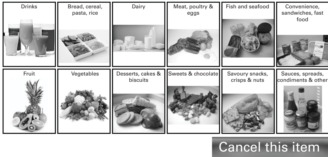
Fig. 2. Screenshot of the Novel Assessment of Nutrition and Ageing (NANA) software high-level food group options.

Minor modifications were made to the NANA dietary software between studies 1 and 3 such as the linking of foods commonly consumed together, and the addition of a 'favourites' facility to speed data entry. These changes did not significantly alter the dietary software interface or the user experience. In all the studies, participants were asked to consume their usual diet throughout the duration of the study. Participants were asked at the end of each study whether they had changed their eating behaviour and whether they had forgotten to record any items while using the NANA method.