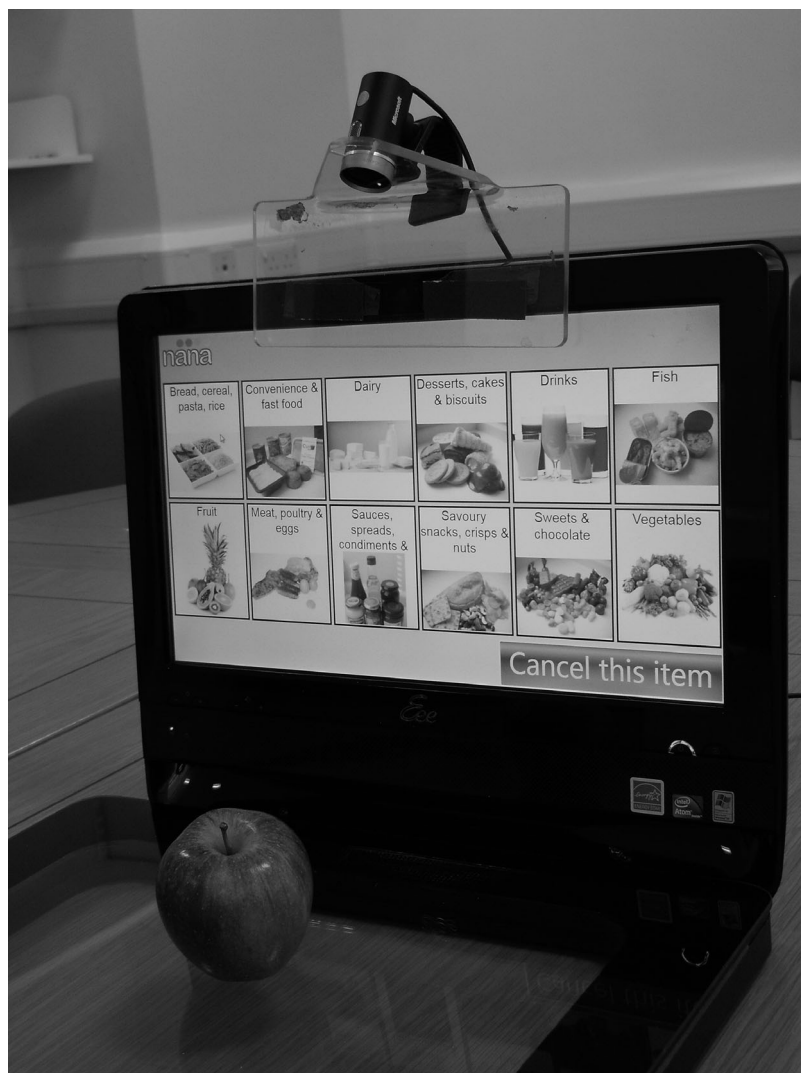
Fig. 1. Image of the Novel Assessment of Nutrition and Ageing (NANA) system.

than the food diary, and only weak-to-moderate associations were observed between nutrient intakes recorded by the 24h MPR method and with both the 4 d estimated food diary and the NANA method (data not shown), and, in addition, no correlations were found between dietary intake and the independent biomarkers of protein and vitamin C intake. From this finding, the 24h MPR was deemed to be a poorer reference method under these circumstances than the 4 d estimated food diary, and it was not used in subsequent studies. The reason for the poorer performance of the 24h MPR compared with the food diary is unknown, but warrants further investigation in future studies.