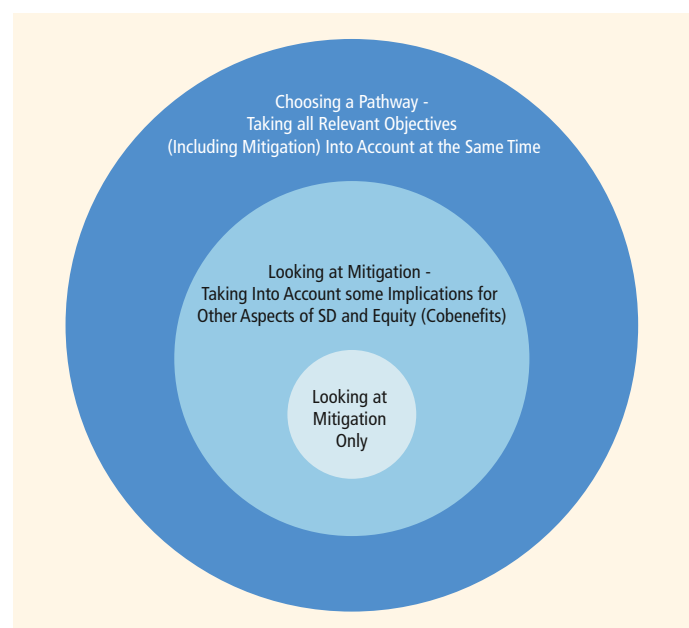
Figure 4.1 | Three frameworks for thinking about mitigation.

The second justification is the legal claim that countries have accepted treaty commitments to act against climate change that include the commitment to share the burden of action equitably. This claim derives from the fact that signatories to the UNFCCC have agreed that: "Parties should protect the climate system for the benefit of present and future generations of humankind, on the basis of equity and in accordance with their common but differentiated responsibilities and respective capabilities" (UNFCCC, 2002). These commitments are consistent with a body of soft law and norms such as the no-harm rule according to which a state must prevent, reduce or control the risk of serious environmental harm to other states (Stockholm Convention (UNEP, 1972), Rio declaration (United Nations, 1992b), Stone, 2004). In addition, it has been noted that climate change adversely affects a range of human rights that are incorporated in widely ratified treaties (Aminzadeh, 2006; Humphreys, 2009; Knox, 2009; Wewerinke and Yu III, 2010; Bodansky, 2010).