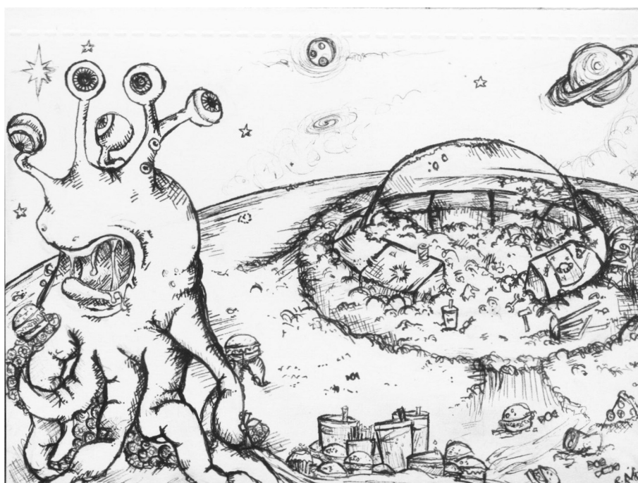
Figure 3 Explaining the Fermi paradox. Evolution of intelligence will always lead to a drive for environmental utopia. Hence, many species may well get fat and spend much of their GDP on healthcare. Life may be everywhere, but due to obesity-related medical issues, it might have to pay a healthcare tax and simply not be able to afford space travel. Without hormesis it may not even be interested.

Although very difficult to cost precisely, sending a manned mission Mars could cost, according to the Mars Society ( http://www.marssociety.org ), somewhere between $30 and $450 billion over 10–20 years. In 2007–2008, it was estimated that the obesity rate (that is people with a BMI of greater than 30 kg/m 2 ), was 33.8% in the USA. If a linear trend line is used, then by 2030, this could reach 51%, although alternative logit models suggest this may only reach 42%. However, if obesity levels were to remain at 2010 levels, then savings could be approaching $550 billion; if obesity had remained at 15%, this could be nearer $1.9 trillion [80]. Thus, by simply tackling obesity, the USA could supply NASA with enough money to send men to Mars even with the most expensive of estimates. Interestingly, George H.W. Bush advanced a plan, in 1989, to send men to Mars, but it was shelved when the estimated cost at the time hit $500 billion; had the nation already got too fat? The figures speak for themselves.