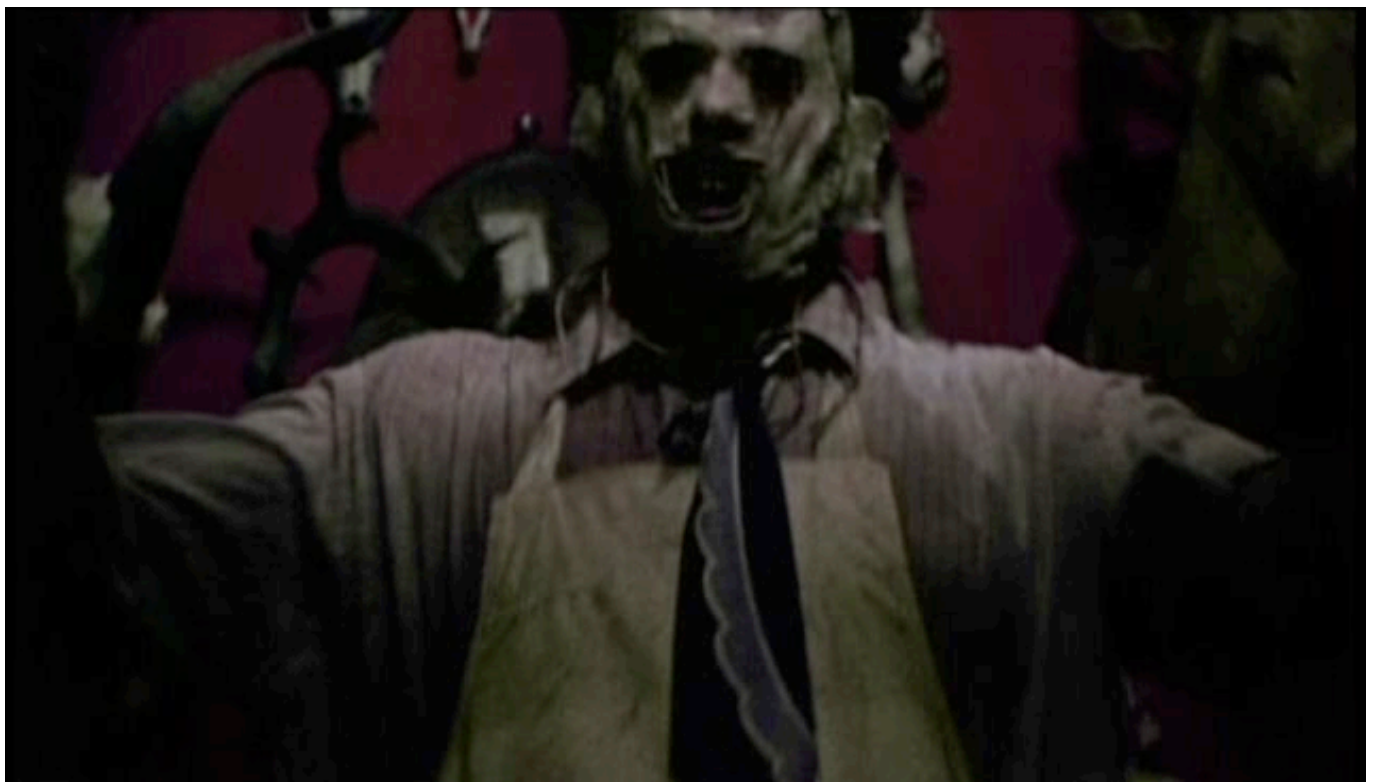
Leatherface (Gunnar Hansen) lifts a hammer to strike Kirk

In this revised critical approach, the interpretative emphasis in looking at Kirk's death is not on access, interiority or understanding the character, but on the striking contrast in the rapid changes between states of physicality. The film fully captures the determination and power of Vail's body as he runs down the hall, but closely follows this with a shot of him twitching helplessly on the floor. While we may have been distanced from him until this point in terms of epistemic access or a moral alignment, the swiftness of the switch from intruder to victim is deeply shocking. Vail's body performs the finality of Kirk's death most harrowingly, his twitching and kicking making the brutality of the act more emphatic. The body is the only point of engagement available to us, ensuring a physical response, an apprehension based almost simplistically on the dynamics of what is