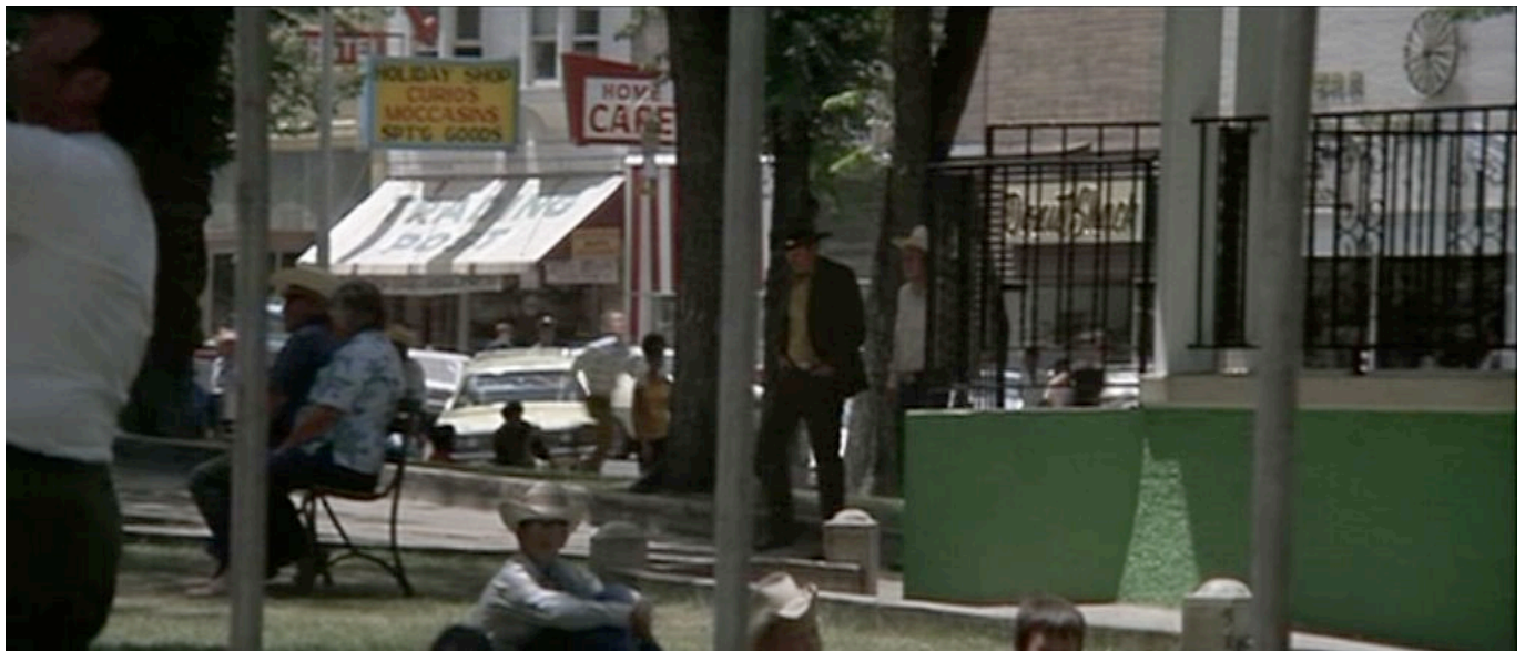
Junior Bonner (Steve McQueen) and Buck Roan (Ben Johnson) talk rodeo deals

draw, and Buck's tentative job offer, the distance imposed suits the discreet nature of their conversation. Furthermore, the scene signals elements of performance to us, despite the distancing of indications of interiority. Not only does Steve McQueen's star status undoubtedly aid a sense of the expressive deliberation, but the scene also cuts closer to the performers at the climax of their interaction. Despite its challenge to formal and generic strategies, Junior Bonner thus demonstrates an expressive economy in the relationship between action and image that is much less appreciable in The Texas Chain Saw Massacre . In the latter, the placement of the camera appears arbitrary, but the effect of this decision is less straightforward. The sequence is unsettling and disorientating, an assault on our expectations of the spatial and temporal relationship between performer and camera. In this context the lack of attention to gestures within the frame could be seen as a wilful unpicking of the traditionally accepted relationship between stylisation and transparency, the stylistic decisions achieving not a balance, but a forceful move against formal containment.