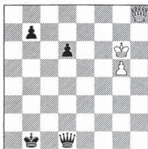
g6b1 4000.12 after 50...d1=Q