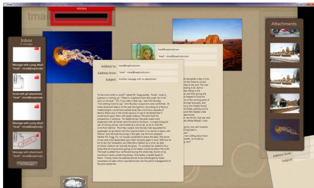
Figure 1: tmail employs visual objects that are familiar to users, and behave predictably.

The tmail application uses a desktop metaphor, with 'unnecessary' functionality (i.e. rarely used features) omitted in order to maintain simplicity and keep perceived complexity to a minimum. See figure 1.