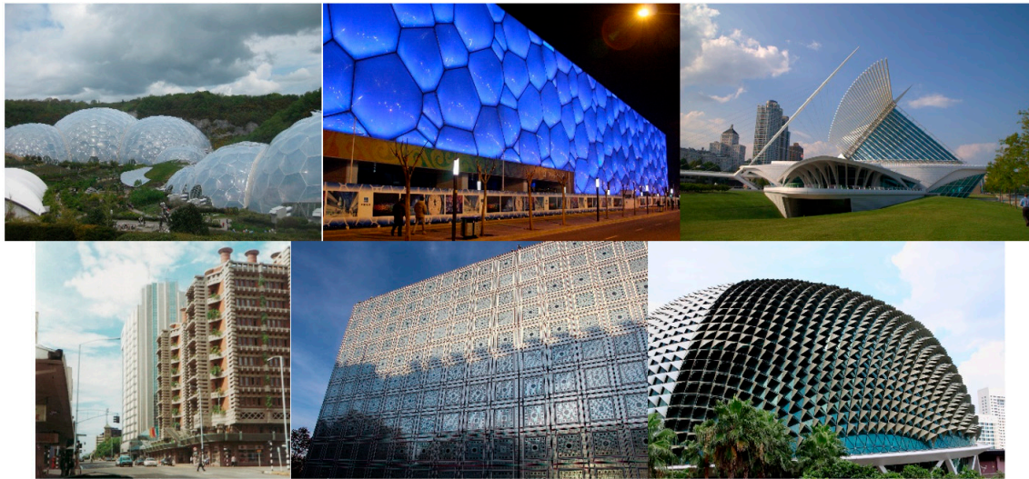
Figure 1. Architectural projects using biomimicry. From left to right ( Top ): Eden Project [24], National Aquatics Center [25], and Quadracci Pavilion [26]. From left to right ( Bottom ): Eastgate Centre [27], Arab World Institute [28], and Esplanade Theatre [29].

durian fruit (Figure 1). For more information on these and other exemplary projects, see Verbrugghe et al. [3] and Radwan and Arch [23].