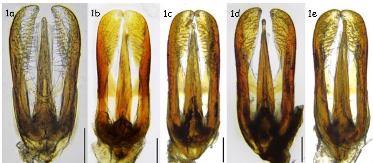
Fig. 1.- Aedeagi. 1a.- Anthrenus chikatumovi . 1b-1e.- Anthrenus isabellinus . Scale bars = 100 \mu m.