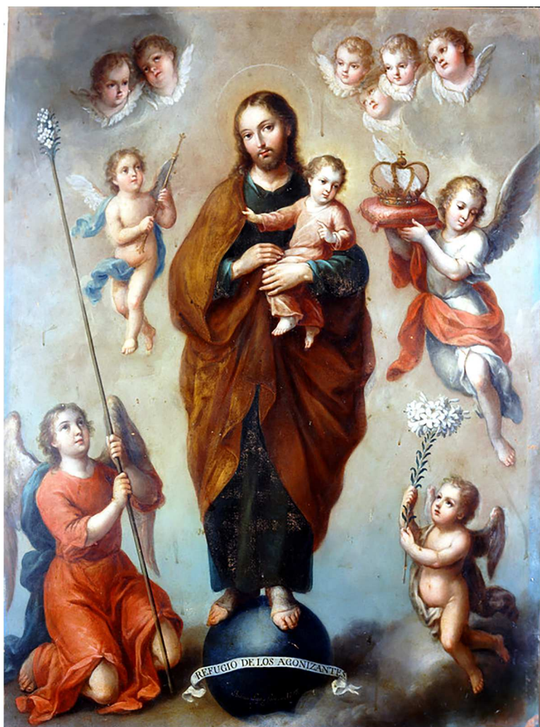
Figure 4. Andrés Lopez. San José, eighteenth century. Painting, oil on metal plate. Museo Nacional del Virreinato, INAH, Mexico

with local practices, the legal definition of such objects as patrimony of the Mexican nation takes priority, and these experts do not generally consider locals' views on the artworks in their churches as reliable sources of information about the objects themselves. They view villagers only as potential custodians or at times, potential threats, to such 'heritagised' objects (cf. Rozental 2016).