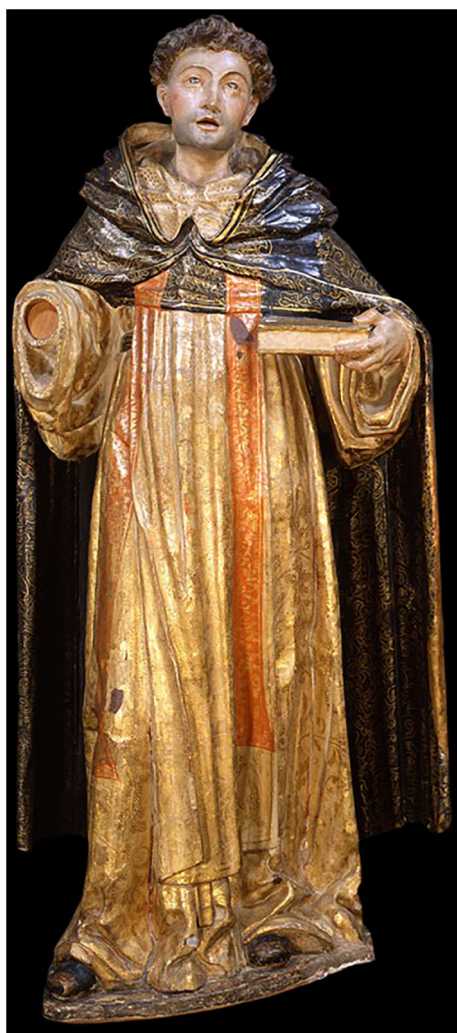
Figure 3. Unknown Artist. San Jacinto de Polonia, seventeenth century. Sculpture, white cedar with polychrome. Museo Nacional del Virreinato, INAH, Mexico.

in gold leaf, and he would always be dressed in a simple habit [see Figure 3 ]. Saint Hyacinth of Poland was indeed a Dominican friar. The nobly born Hyacinth (Jacek) Odrowąż became one of the first followers of St Dominic in 1220, eventually becoming known as the Apostle of the North. In fact, not only would Saint Hyacinth have worn the plain black and white Dominican habit in life, but this clothing is doubly iconic of him from the perspective of art history. In addition to his miracles, 'the clothing of Saint Hyacinth by Saint Dominic' is a key moment in his hagiography that is frequently represented in religious artworks (Walczak 2018). 19 The Mixtepec Saint also lacks the more standard 'attributes' of Saint Hyacinth: a ciborium or monstrance in his right hand and a statue of the Virgin Mary in his left (although these are not always present, as Figure 3 shows). From a purely art historical perspective, one could simply conclude that the priest and the art historians are correct: that the statue is Saint Joseph, and the villagers