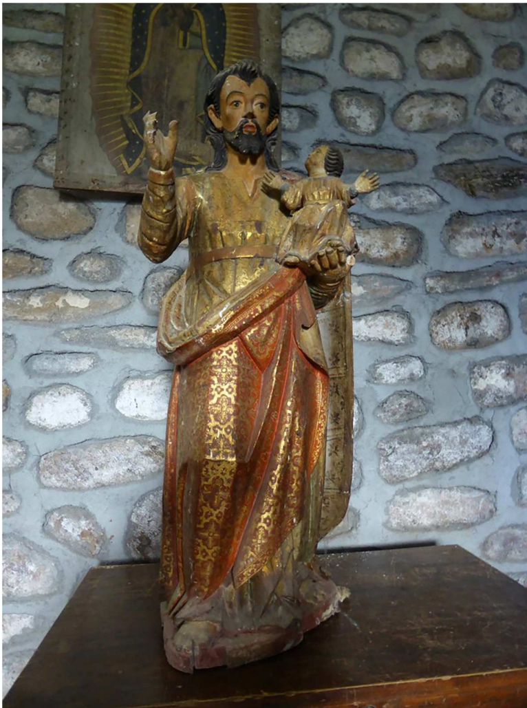
Figure 1. The 'Mixtepec Saint.'

The figure of the Mixtepec Saint is carved entirely from a single piece of hardwood, most likely alder or cedar, and its robes are decorated with yellow and red pigments, overlain with patterning in gold leaf to indicate fabrics rich with embroidery and embellishment [Figure 1]. The saint's right hand is raised in blessing, and he holds a child in the crook of his left arm. The child, whose form more resembles a miniature adult than an infant, opens his arms to embrace the viewer, even as he turns to look into the face of the saint who cradles him. The saint's features are decidedly European: fair skin, angular cheekbones and a tapering nose; his flowing black hair, moustache and double-pointed beard are formed of sculpted curls and waves. Unlike some other sculptures of the period, his eyes are not made of glass, but are carved from the wood itself.