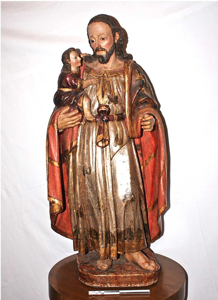
Figure 2. Unknown Artist. San José, n.d. [colonial period]. Sculpture, wood with polychrome. Museo de las Culturas de Oaxaca, Exconvento de Santo Domingo de Guzmán, INAH, Mexico.