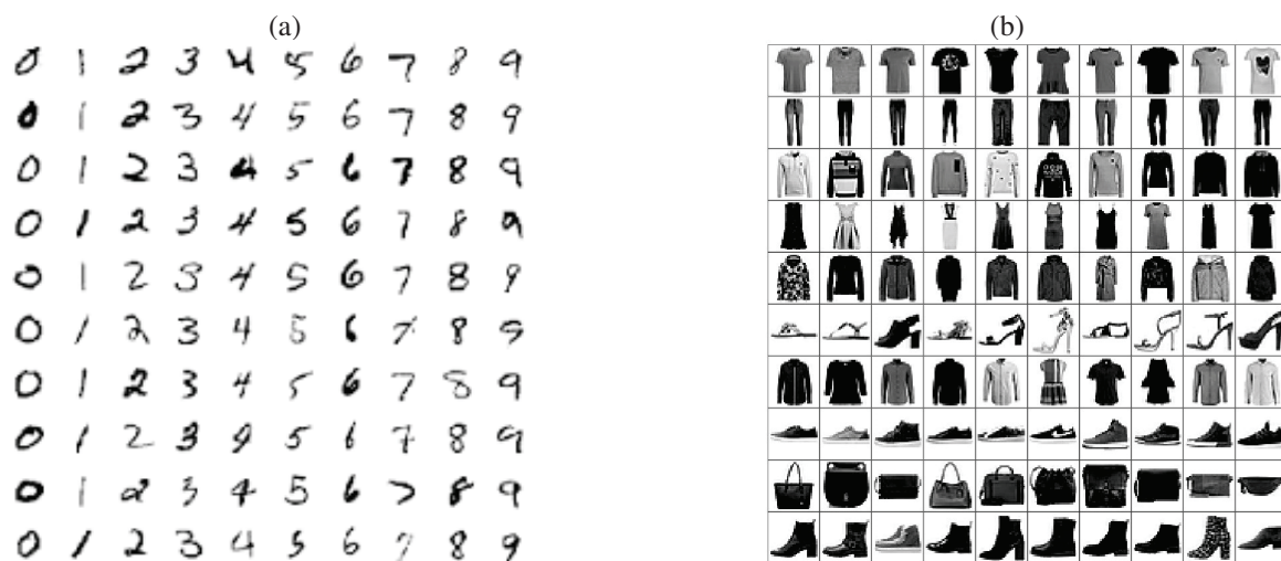
Fig. 1. 10 sample images per class are shown as visual comparison between (a) mnist and (b) fashion-mnist ; Each data-set has 70000 images.