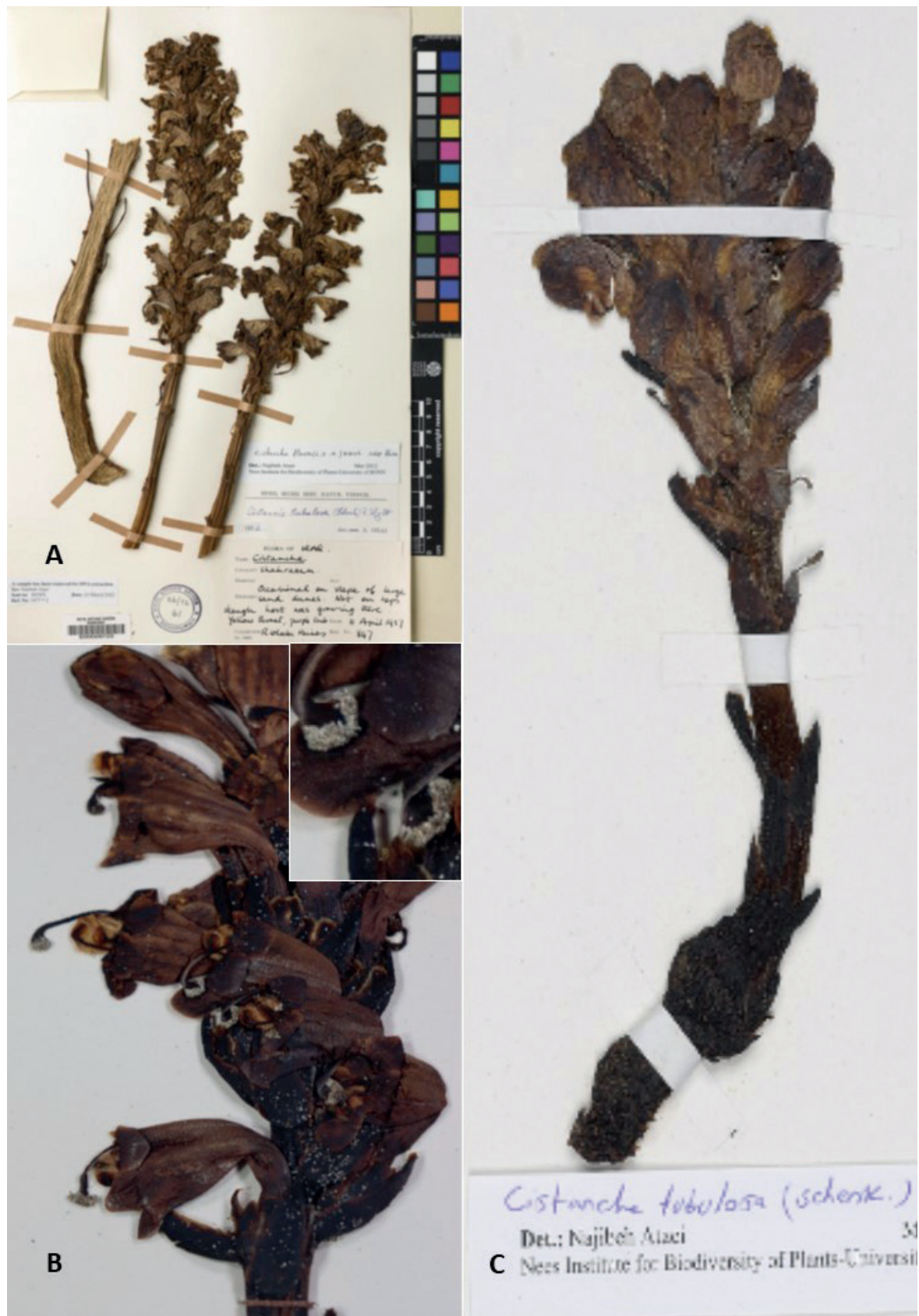
Figure 2. A herbarium specimen of C. tubulosa collected in Iraq, mistakenly identified as C. flava B the holotype of putative species C. chabaharensis ; note the woolly anther (inset) typical of C. tubulosa C herbarium specimen of C. tubulosa in (W) collected in lowland of Iraq, mistakenly identified as C. salsa .