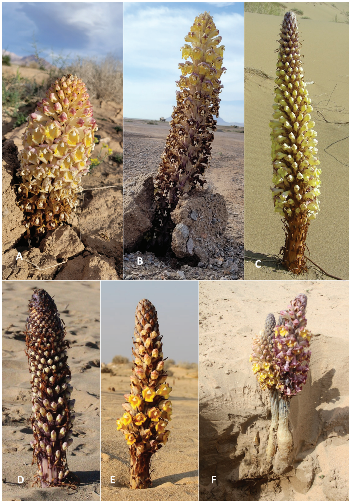
Figure 4. Cistanche species putatively found in Iraq and adjacent territories A, B C. tubulosa (photographed in Iran) C, D C. flava (photographed in Kazakhstan) E, F C. tubulosa (photographed in Iraq; note excavated stem bases in E ).