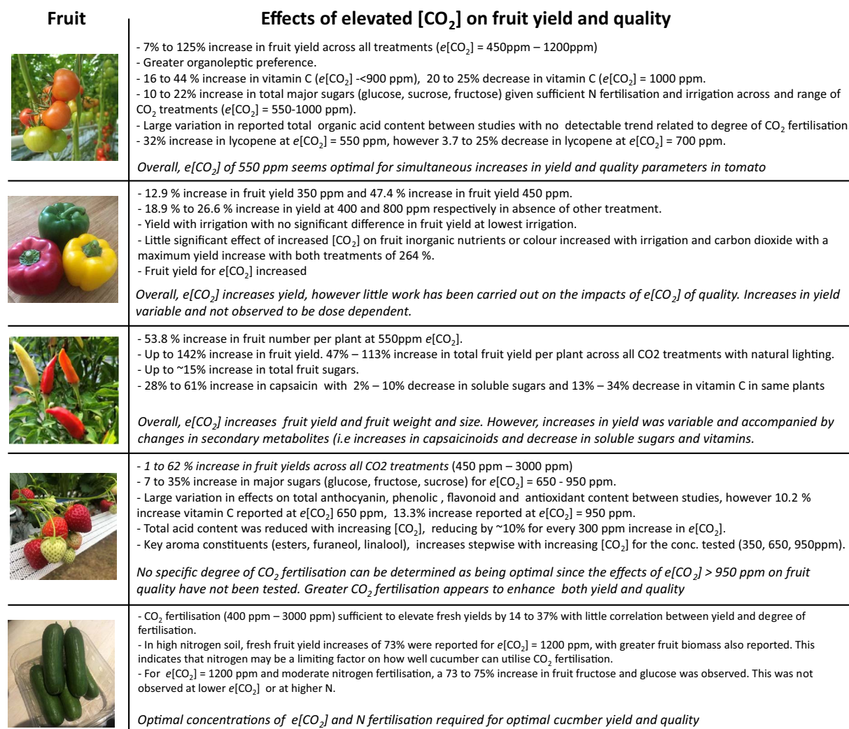
Figure 2. Effects of elevated [CO 2 ] on yield and quality of fruiting crops. Created with BioRender.com

aromatic apocarotenoid \beta -ionone, which is important to tomato fruit flavour. Furthermore, lycopene, shown to increase under e[CO_2] is cleaved by CCD1 to form several important flavour and aroma compounds including 6,10-dimethyl-3,5,9-undecatrien-2-one (pseudoionone [34]), 6-methyl-5-hepten-2-one (MHO [36]; and geranial [37]. MHO has been shown to be an important contributor to tomato fruit flavour [38, 39] and has also been shown to accumulate in tomato fruit with higher lycopene levels [40]. It is therefore apparent that growth in e[CO_2] can increase a range of key flavour and nutraceutical precursor compounds present in tomato fruit; this phenomenon deserves further study, the optimal levels of [CO 2 ] are currently not clear and more work is needed to better understand the relationship between CO 2 assimilation carotenoid content, flavour and overall quality (Table 2).