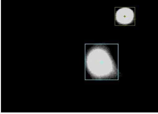
Figure 1. Blob detection

[16], blob is defined as a compact set of pixels that share some visual properties that are not shared by the surrounding pixels. These properties could be colour, texture, brightness, motion, shading, a combination of these, or any other salient spatio-temporal property derived from the image sequence. An example of blob detection is shown in Fig. 1.