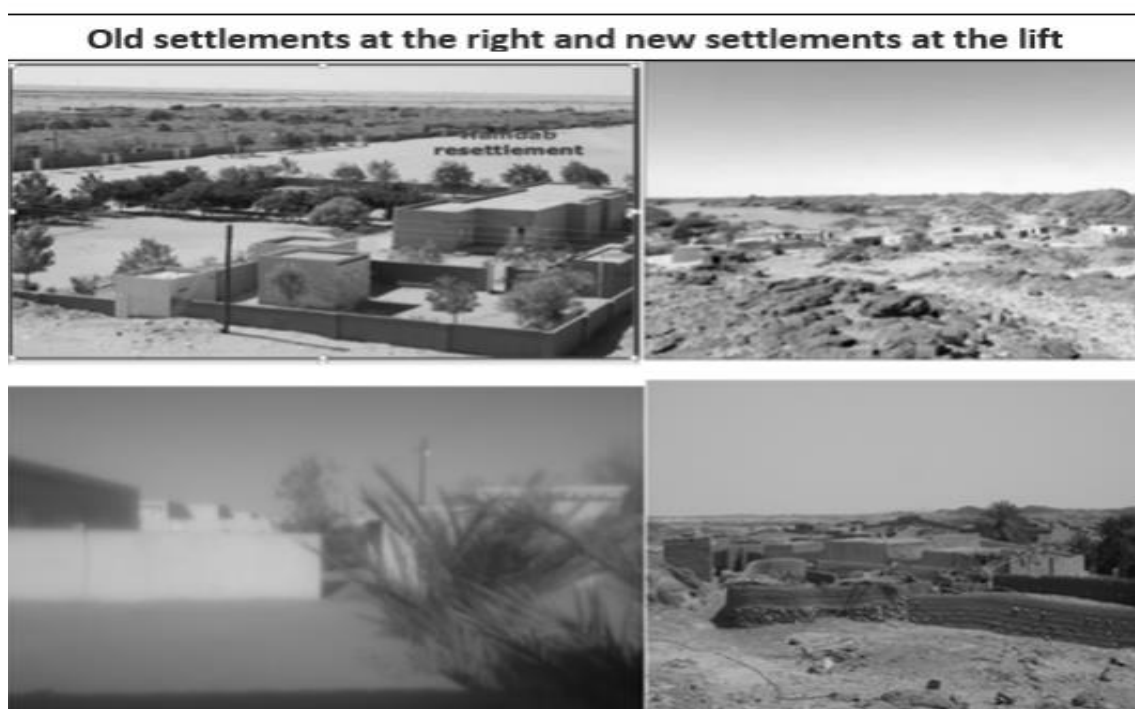
Figure 2. Images of new settlement and old settlement: Source: Author.

These opinions about the new settlement are supported by many respondents who challenge the critics of dam resettlement, such as Scudder (2012) and Jackson and Sleigh (2000). Singh’s study of 50 large dam resettlements in five continents (1997) acknowledged that living standards in resettlement areas have improved slightly and livelihoods have been restored to some degree. The Sudanese government’s misrepresentation of the Merowe Dam resettlement through its control of the media portraying the substantial facilities of the new houses, land, services, and financial compensation misled the Sudanese public and encouraged a dialogue that was critical of the Manasir, and others affected who protest or show dissatisfaction with resettlement.